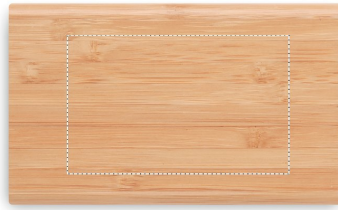
2. FRONT PAD